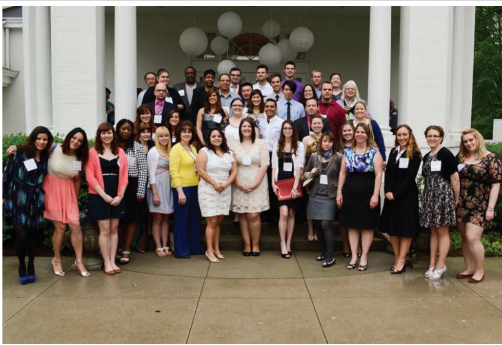
MEMBERS OF THE 2013 GRADUATING CLASS SAY "THANK YOU"!

Thank you for sharing your time and treasure with us. Every gift made these last seven years matters, and we are grateful.