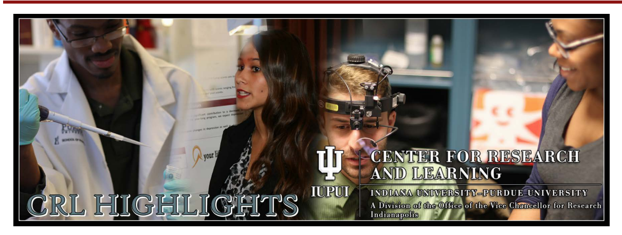
For older newsletters, please visit the News Archive.