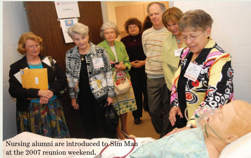
Nursing alumni are introduced to Sim Man at the 2007 reunion weekend.

The IU School of Nursing has been designated a Laerdal Center of Excellence and is working closely with them to support further design and implementation of simulations into the teaching process. The partnership enables IUSON faculty to delve more deeply into the practice of integrating simulations into the nursing curriculum and to investigate students' learning experiences involving clinical knowledge, skills and clinical