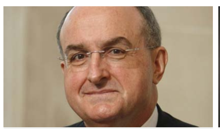
IUSM precision medicine proposal one of five IU Grand Challenges finalists