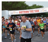
Start of Race