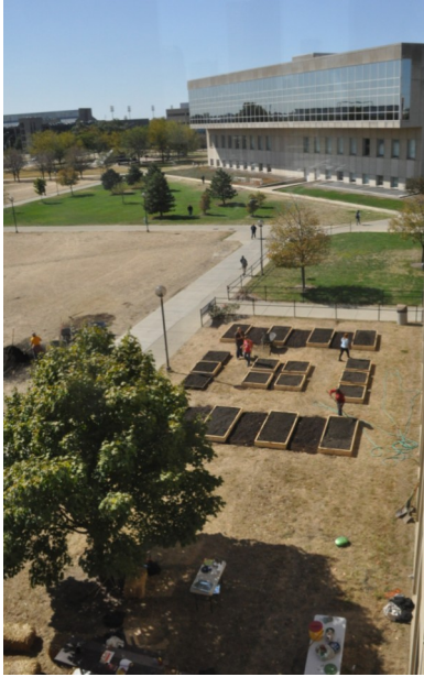
Raised garden bed overview

For those of you trying to hold onto an image of your summer garden while walking the snowy landscapes around campus, you now have a place to ponder your field of green. An urban garden is now solidly place on our campus. Some of you may have noticed a series of wooden box-like frames filled with dirt just south of the science building. Just take a short walk from the library toward North Blackford street and you'll see it tucked up against the building.