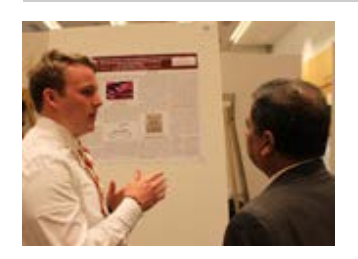
Research Day was a huge success!