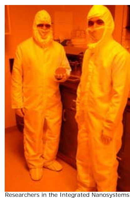
Researchers in the Integrated Nanosystems Development Institute Lab are developing nanosensors to identify the signature

• Identify the signature odorants that are