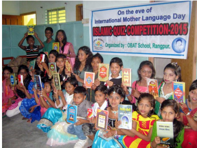
Rangpur school children with their prizes on competition day

On February 21st, OBAT Helpers Bangladesh observed International Mother Language Day. An inter-school cricket tournament was organized among all Chittagong schools namely, Halishaher, SB Nagar and Ferozeshah. The cricket matches were hosted by the Halishaher School. Khulna School organized a hand writing competition for their students while Rangpur School organized an Islamic quiz competition for their students studying there. Dhaka English School students participated in an Art competition. The youth of Mohammadpur camps under the banner of OBAT Think Tank brought out a rally and paid homage to the martyrs at Central Shaheed Minar.