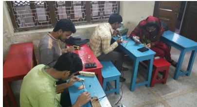
Students configuring electronics

"The financially struggling student participants from refugee camps can bring in tremendous insight about the real life conditions of the poorest communities of the country. They can give us an idea of what kind of products are most needed in poor households." The two month training program is being held at OBAT's facilities at Mohammadpur.