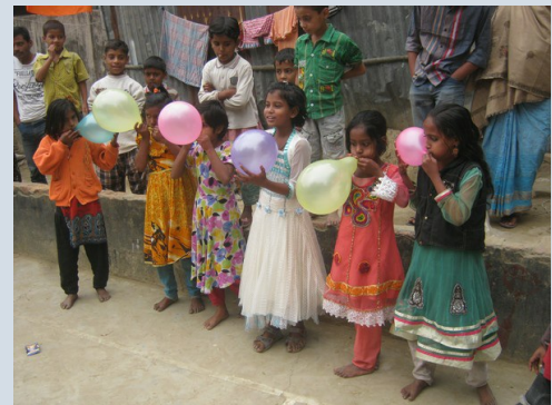
Preschoolers Celebrating at Annual OBAT Sports Day

In 2014, OBAT's preschools prepared 486 children to enter first grade. We are looking forward to enrolling more excited and eager preschoolers this year! Read more here: http://bit.ly/1c3xh0J