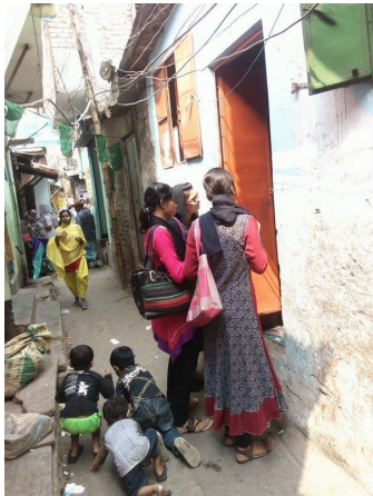
Volunteers gather information from camp residents