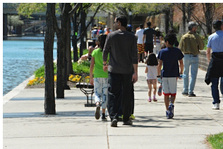
Walkers at the 2014 Race for Rehma

For several years, through Race for Rehma, OBAT has contributed to a local cause in its home city, Indianapolis. This year we are joining hands with the Syrian Refugee Initiative, (spearheaded by the Center for Interfaith Cooperation) to welcome and settle Syrian refugees in Indianapolis. More than half of the Syrian people have been displaced from their homes in the four year old Syrian civil war and now it's our turn to show Rehma/compassion. Join this walk for compassion to help build a new life for refugees arriving from Syria.