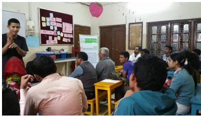
The workshop in progress

OBAT's partner, CHANGE, has arranged a training course with the collaboration of the U.S. department of State, in which, participants will work on developing renewable energy products. The program was initiated on December 29th 2014 in Dhaka. Twenty-