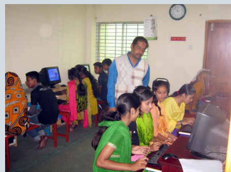
Computer Course in Progress

Last year, a new computer training course was introduced for Junior School Certificate students. It was