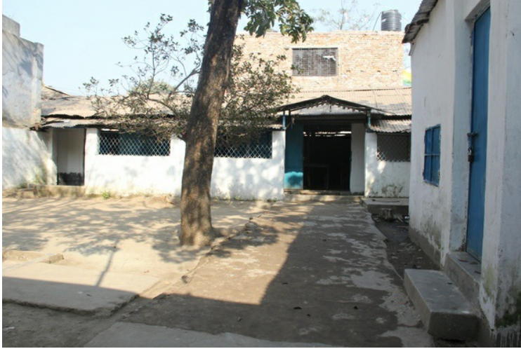
The school building

We are elated and proud to report that a new school has been added to OBAT's educational projects. This high school is located in Mirpur camp which is the biggest camp in Dhaka and contains more than 20% of the population of Urdu speaking people.