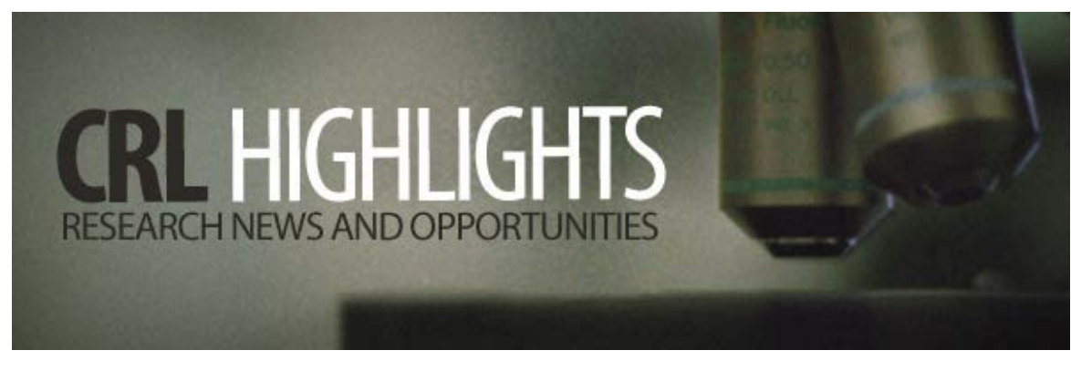
For older newsletters, please visit the News Archive.