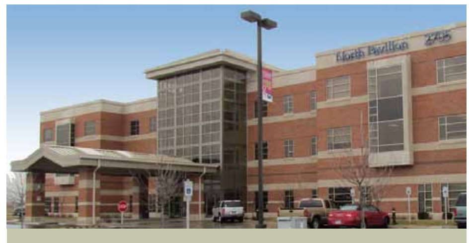
The North Pavilion at Witham Health Services in Lebanon, the location of the newest satellite Glick Eye Institute.

"Previously, many patients were seeking treatment outside of our