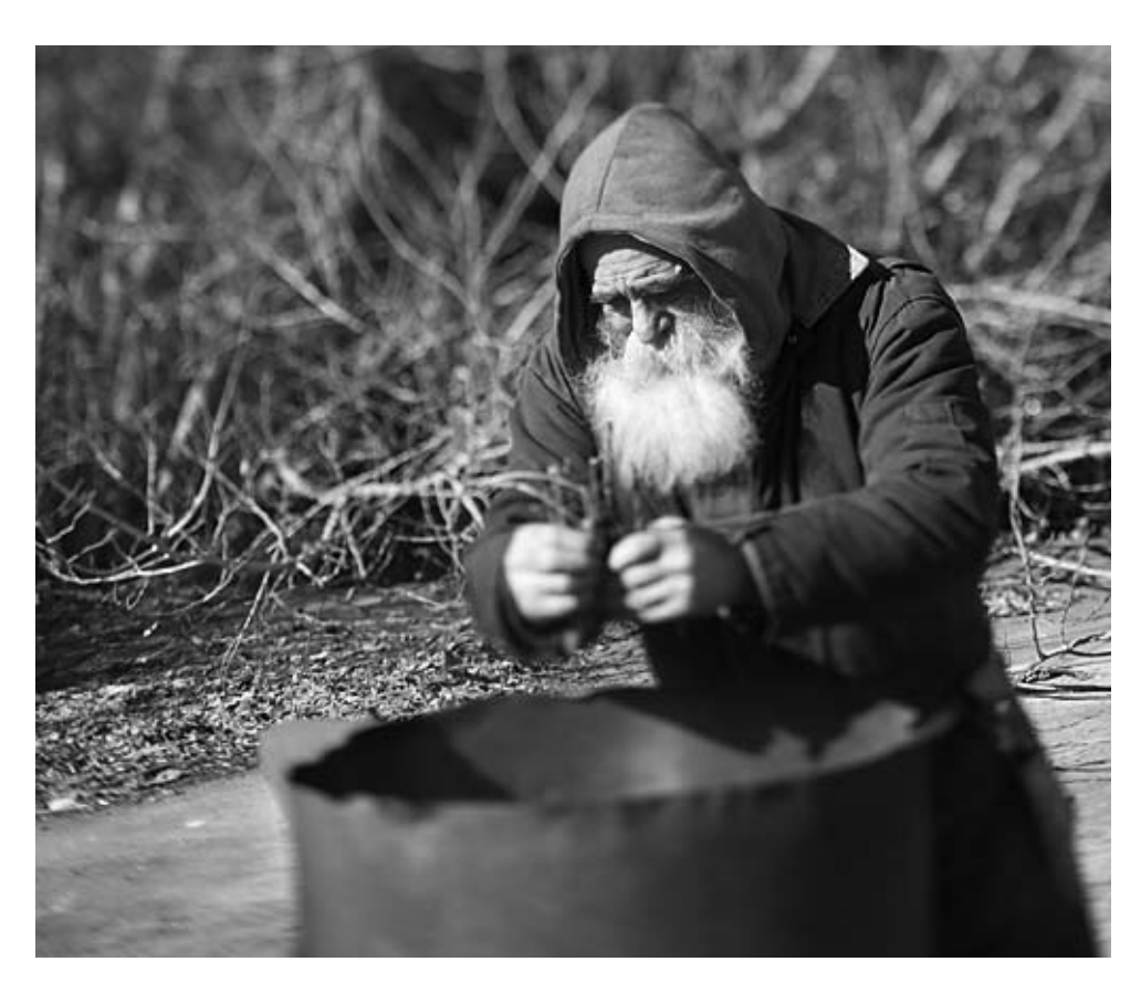
On cold days in January, such as when the 2007 Homeless Count was taken, some homeless individuals struggle to keep warm. In this photo, a man warms his hands over a fire in a metal can.

aid and prevention. To qualify for federal funds for homelessness programs, HUD requires communities to participate in periodic surveys so that it can estimate the extent of homelessness in America, provide Congress with information on services, identify service gaps, and make informed funding decisions. The two counts sponsored by HUD are the biennial point-in-time count (a one-night count of sheltered and unsheltered homeless persons) and an annual housing inventory count (an inventory of beds for the homeless, including seasonal and overflow beds).