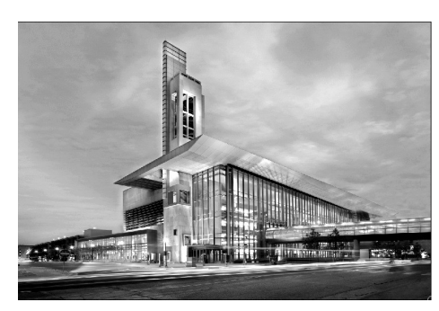
IUPUI CAMPUS CENTER

Welcome to the first issue of the Campus Center Update. This will be a semi-annual electronic newsletter targeted toward IUPUI faculty and staff. We will provide reminders about basic services available in the facility, as well information about new services, and updated policies. For additional information check out our website at www.life.iupui.edu/campus-center, call our administrative office at 278-8511 or stop by CE 278.