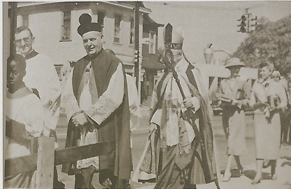
St. Rita Church

1970s Brightwood loses a doctor's office, accounting and bookkeeping services, cafe, insurance company, Salvation Army store, drug store, pool hall, and pet store. Crime and vandalism continues to rise.