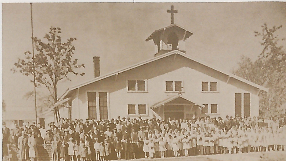
St. Rita Church