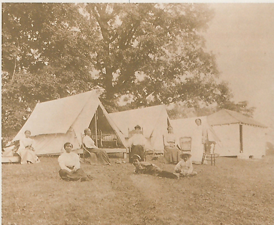
The Oakhill Convalescent Tuberculosis Camp near Brightwood, ca. 1916

1935 The Brightwood Community Center is founded with headquarters at 2305 N. Rural St. The center acts as a social and educational headquarters for many African-Americans in the neighborhood.