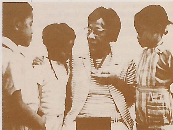
Edna Martin Christian Center

1998 The suburban East 91st Street Christian Church opens the Jireh Sports facility to teach gymnastics, as well as academic tutoring and religious education.