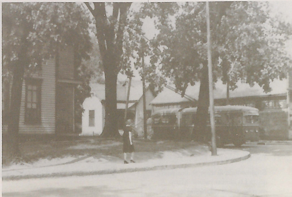
Brightwood, ca. 1940

Under an IndyParks program, Oasis of Hope Baptist Church assumes management of Douglas Park while St. John's Missionary Baptist Church manages J.T.V. Hill Park.