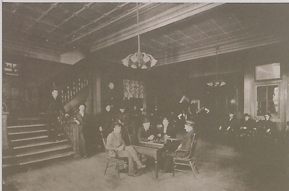
Interior of Brightwood Y.M.C.A., 1905

Indiana Historical Society, Bass Photo Co. Collection #4501