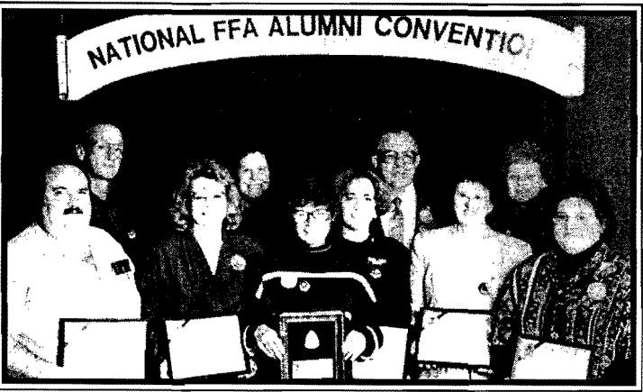
Pictured above are representatives from the affiliates recognized as national winners in the scrapbook contest.