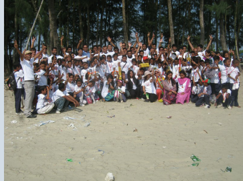
Halishaher kids with Decathlon employees

Decathlon, a French sporting goods company, celebrated its founding day with OBAT's Halishaher School students. The employees of Decathlon, Bangladesh, devoted their entire day to playing a variety of games with our students. They organized the program at local beach, Parkir Char, 40 km away from Halishaher. Entertainment and meals were arranged for the students. Winning teams were awarded medals for their performance in the games while t-shirts and caps were gifted to all by Decathlon. We are very grateful to Decathlon for frequently arranging events for children, for choosing OBAT's Halishaher School children for this program.