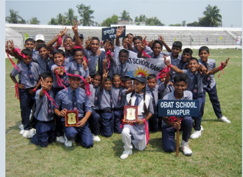
Rangpur School team

On the 45th independence and national day of Bangladesh, the Rangpur district administration organized a parade in which 102 groups took part.