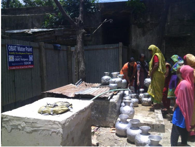
Women get water from the new tubewell

A new tubewell has been installed at Ferozeshah camp in Chittagong. A special thank you to our supporters for contributing towards this project. There is a severe scarcity of clean water in the camps and water-borne diseases proliferate due to lack of potable water. This tubewell is another step toward solving the severe water crises faced by the residents.