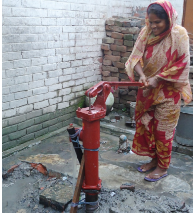
A woman draws water from a newly installed hand pump at Ishurdi