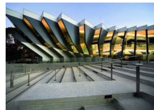
The John Curtin School of Medical Research