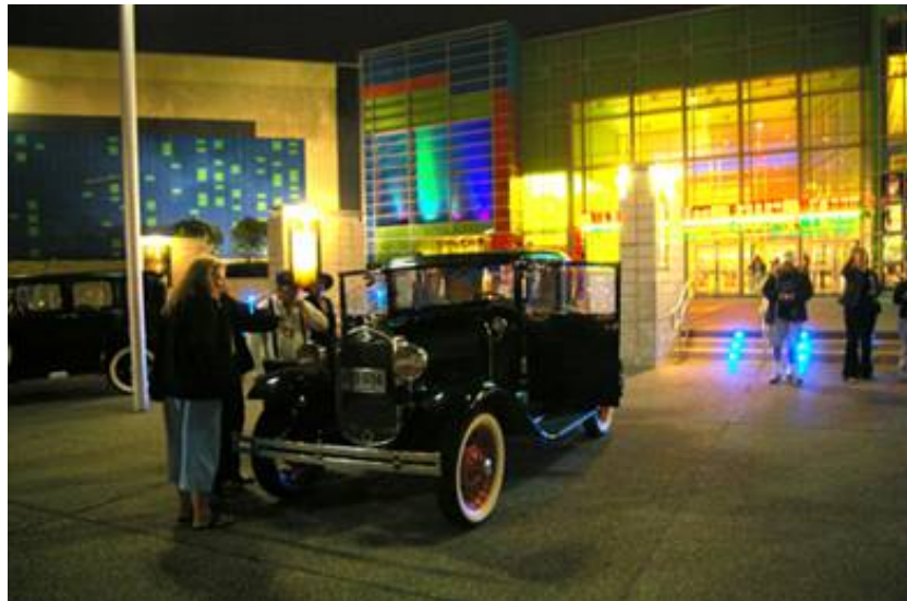
Museum-goers explore the Dillinger! exhibit, created by IUPUI students