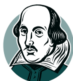
Shakespeare TB – or Not TB.