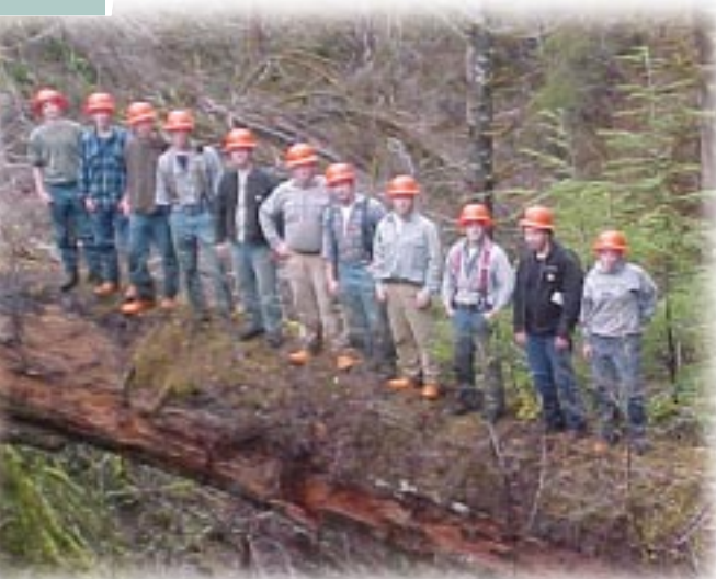
Elma students take a break during a field work session.

“We live in an issues-based society in the natural resources arena, but many people don't know how to dissect information and determine what is factual.”