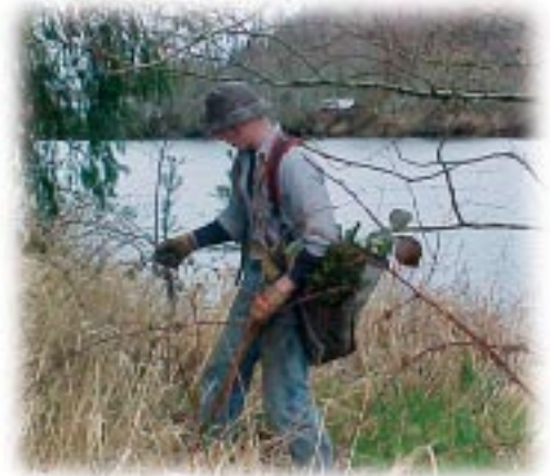
Hands-on learning attracts students into the program.