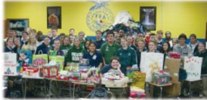
Ponchatoula FFA members pose with the gifts they gathered for their adopted families.

Beyond raising funds to support the Ponchatoula FFA Chapter's needs, the members also raise funds to support other