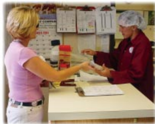
Florence FFA members staff the chapter’s meat market.