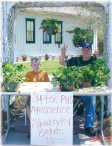
PHS students sell strawberry baskets as a fundraiser.

The transformation started when the school's principal stood firmly behind DuBois and her efforts. "The chapter had no program of activities, no advisory board – none of the structural elements a program needs to build its strength," DuBois says.