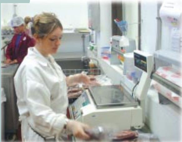
A student packages and prices products at the chapter’s meat market.

For more information about this unique program, visit the website at www.florenceffa.org .